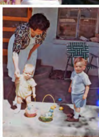
EAST FEB 1966