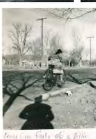
Peggy on bike with a Biker