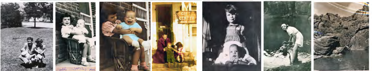
Daddy sitting with