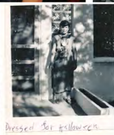
Dressed for Halloween