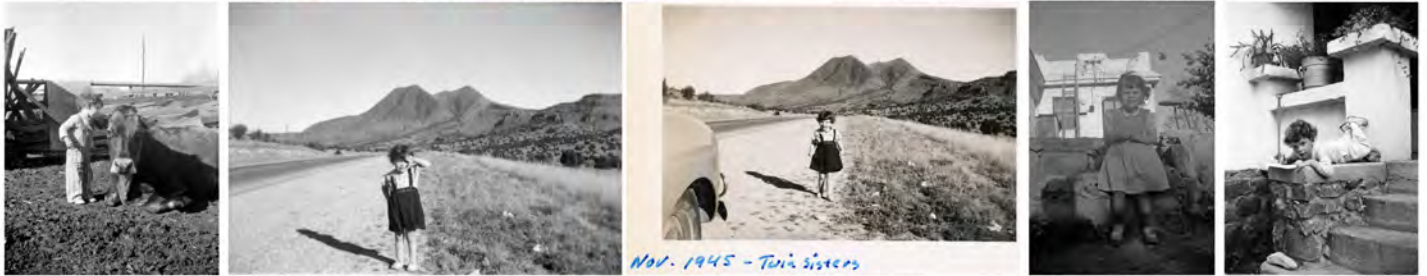
Nov. 1945 - Twin sisters