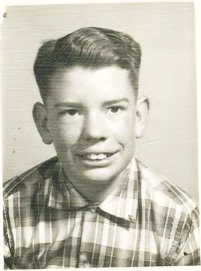
CENTRAL SCHOOL 1958-59