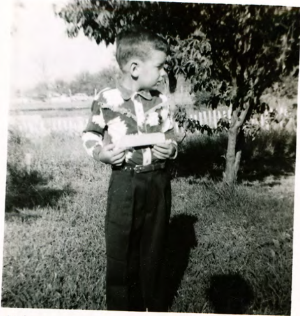
First day of school 1952